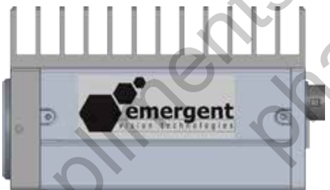
Side View Dimensions