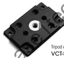
Tripod Adaptor VCT-ST701